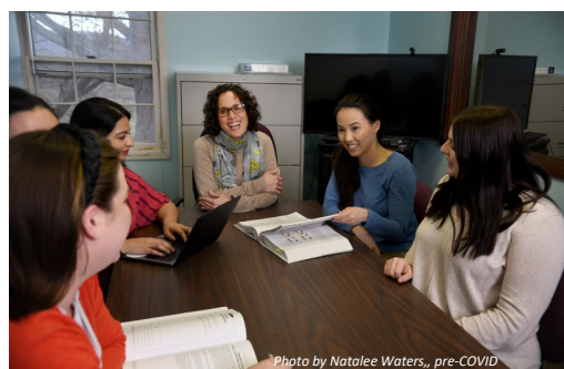
pre-COVID

Since its inception in June of 2018, the MAC travelled over 7,600 miles and served 40 families with therapy, assessments and/or psychoeducation sessions.